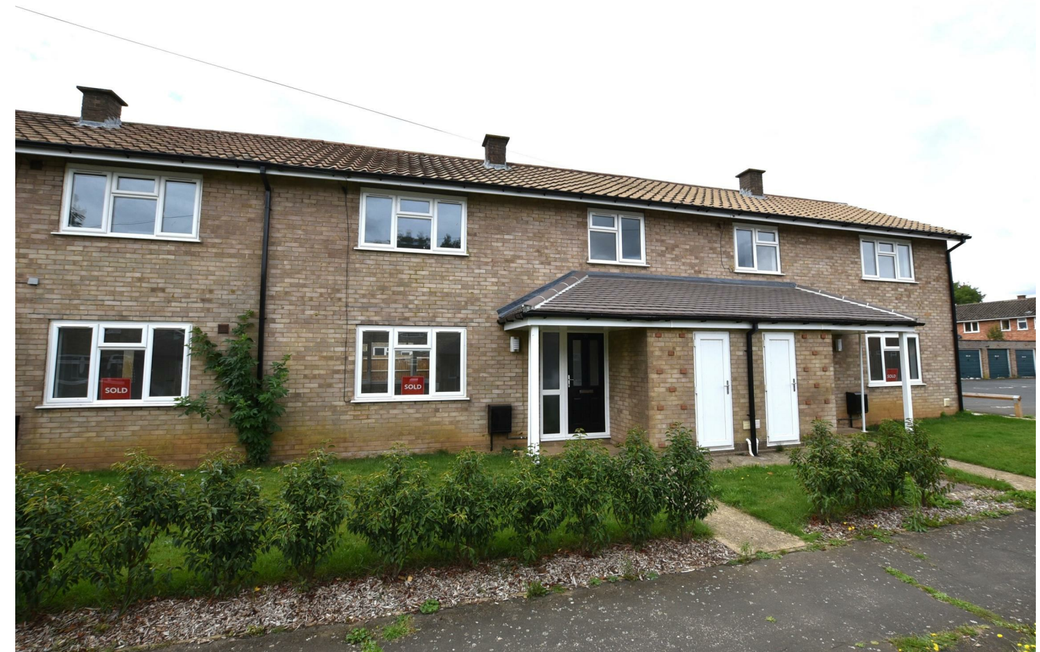
70 Lawrence Road, Wittering, PE8 6EW