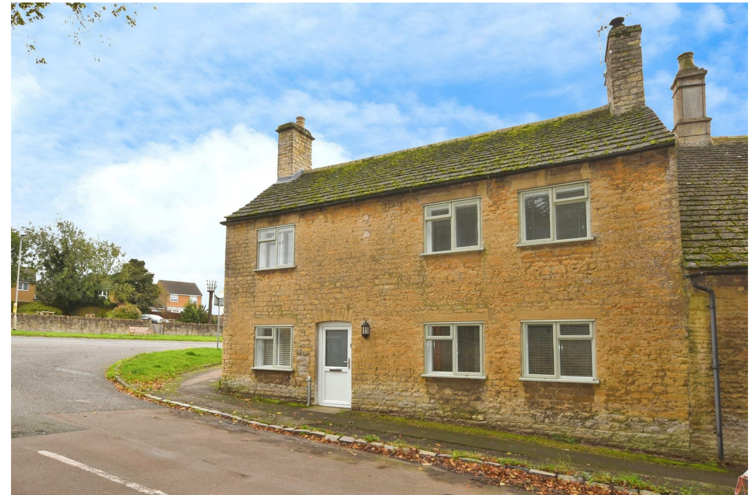
1 High Street, Collyweston, Stamford, PE9 3PW