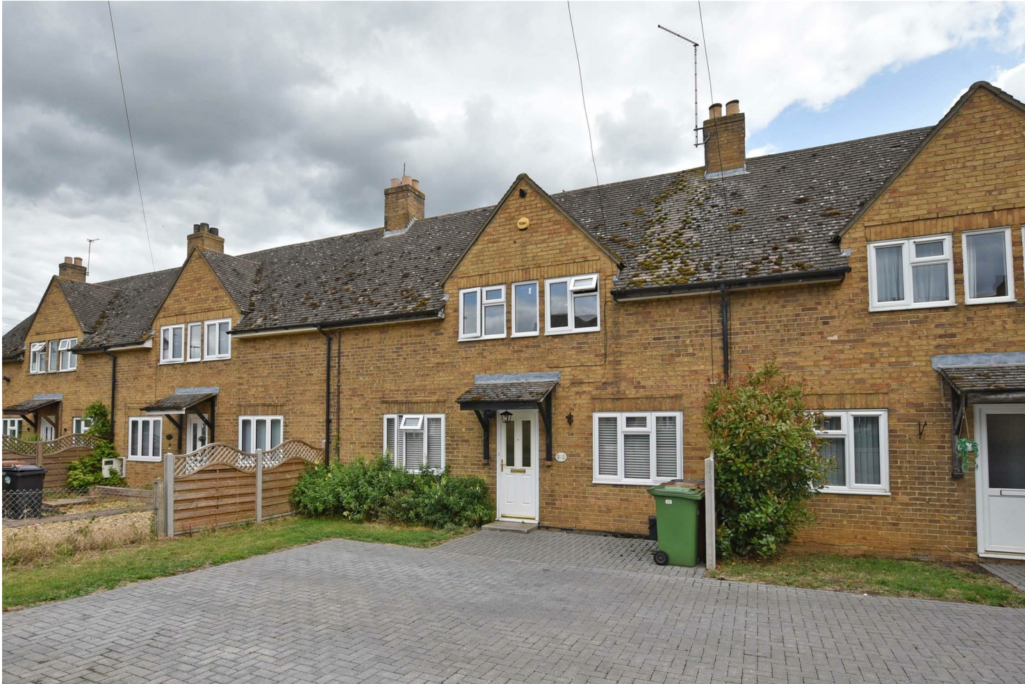
32 Uffington Road, Barnack, Stamford, PE9 3DU