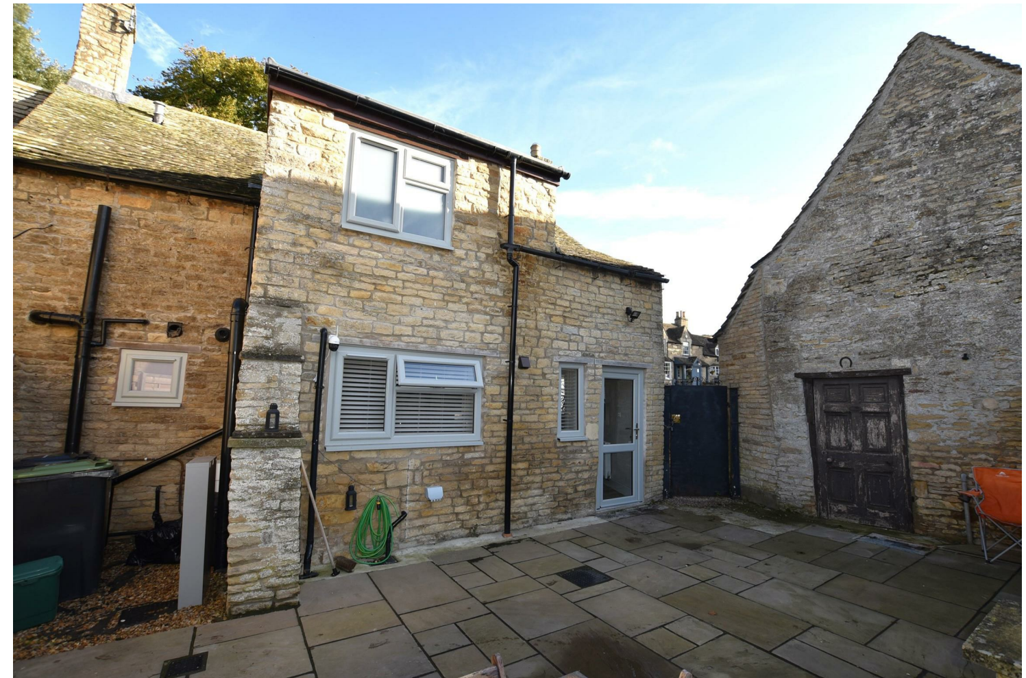
1 High Street, Collyweston, Stamford, PE9 3PW