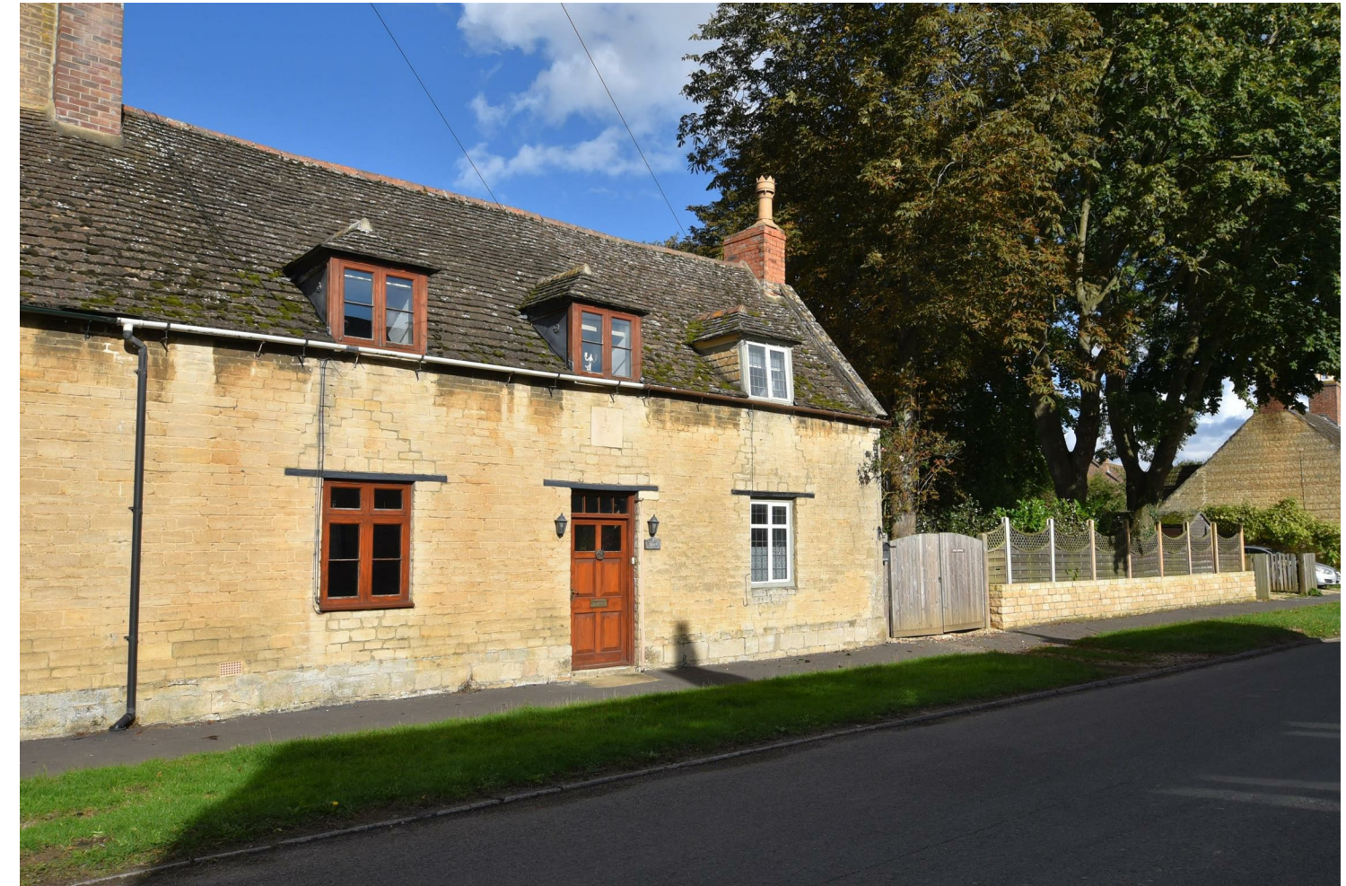
Rose Cottage Main Street, Greatford, Stamford, PE9 4QA