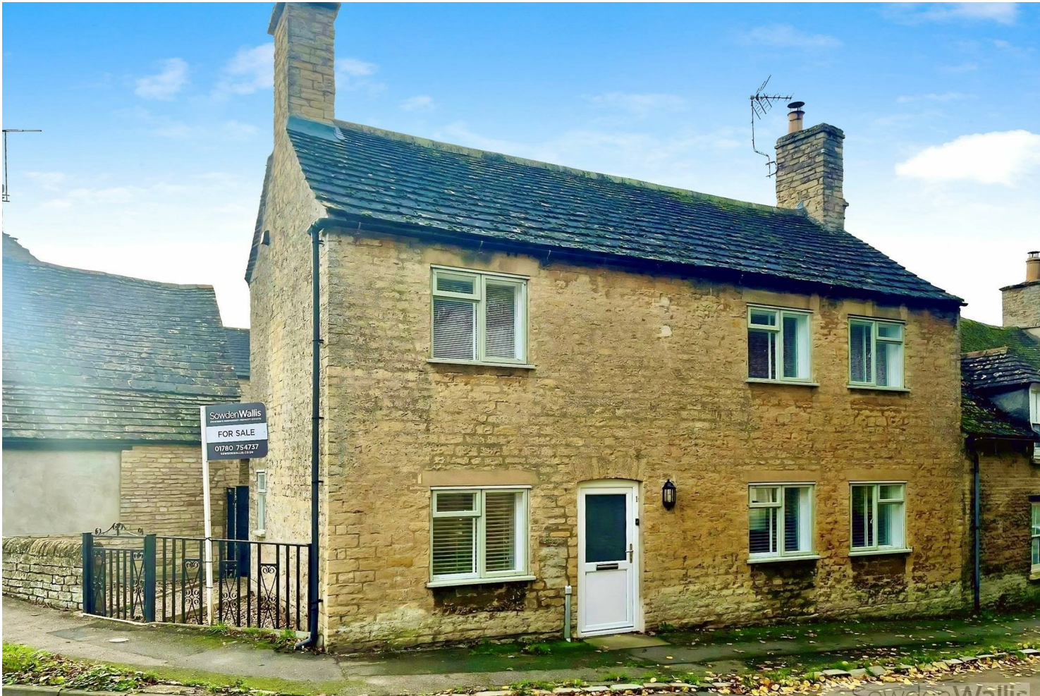
1 High Street, Collyweston, Stamford, PE9 3PW