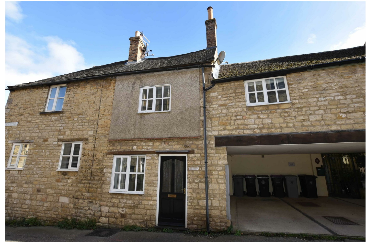
2 Church Lane, Stamford, PE9 2JU