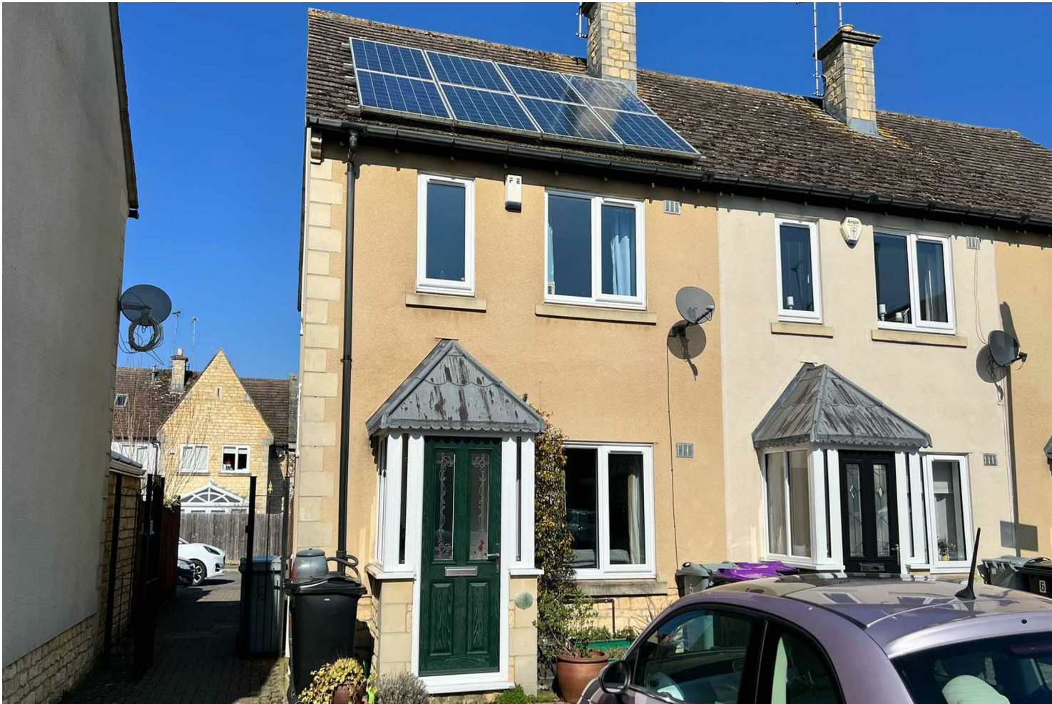
5 Garratt Road, Stamford, PE9 2ZD

Set a stones throw away from Stamford train station, this two bedroom end-of-terrace home comes with solar panels, a spacious sitting room and two bedrooms. The property provides easy access to the town centre and Meadows, and is ideal for downsizing or commuters alike.