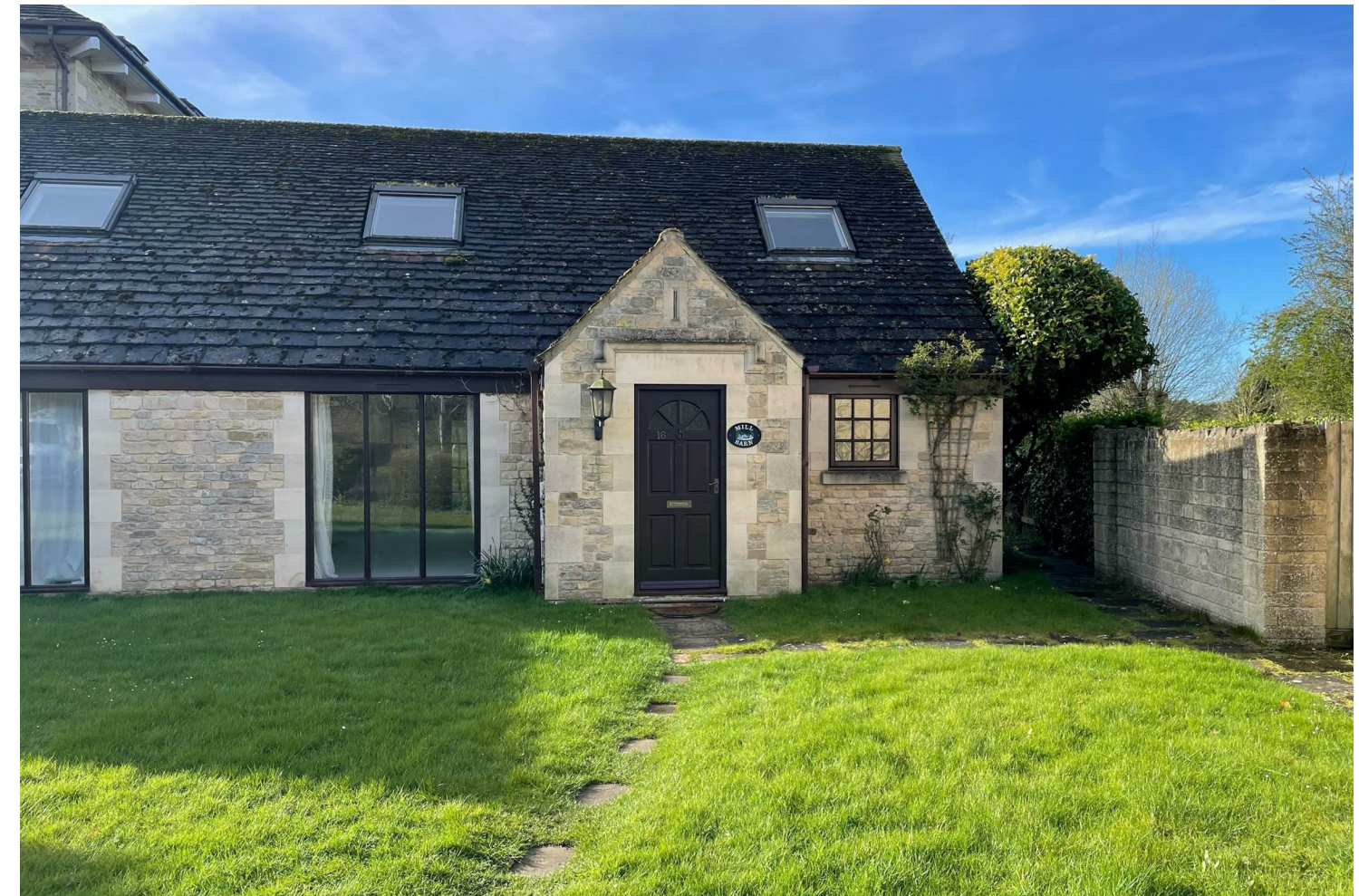
Mill Barn 16 Newstead Mill, Newstead, PE9 4TF