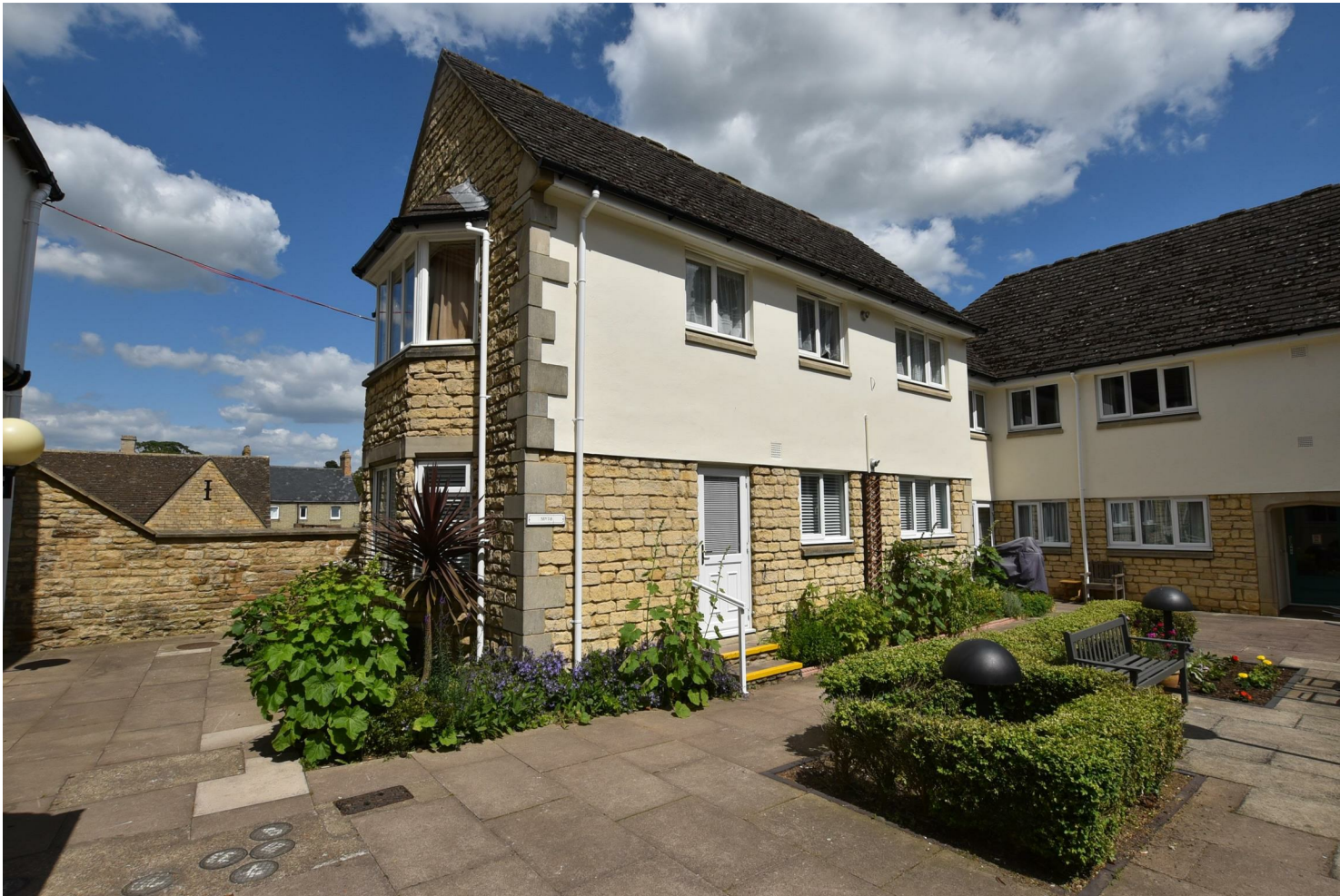
8 Torkington Gardens, Stamford, PE9 2EW