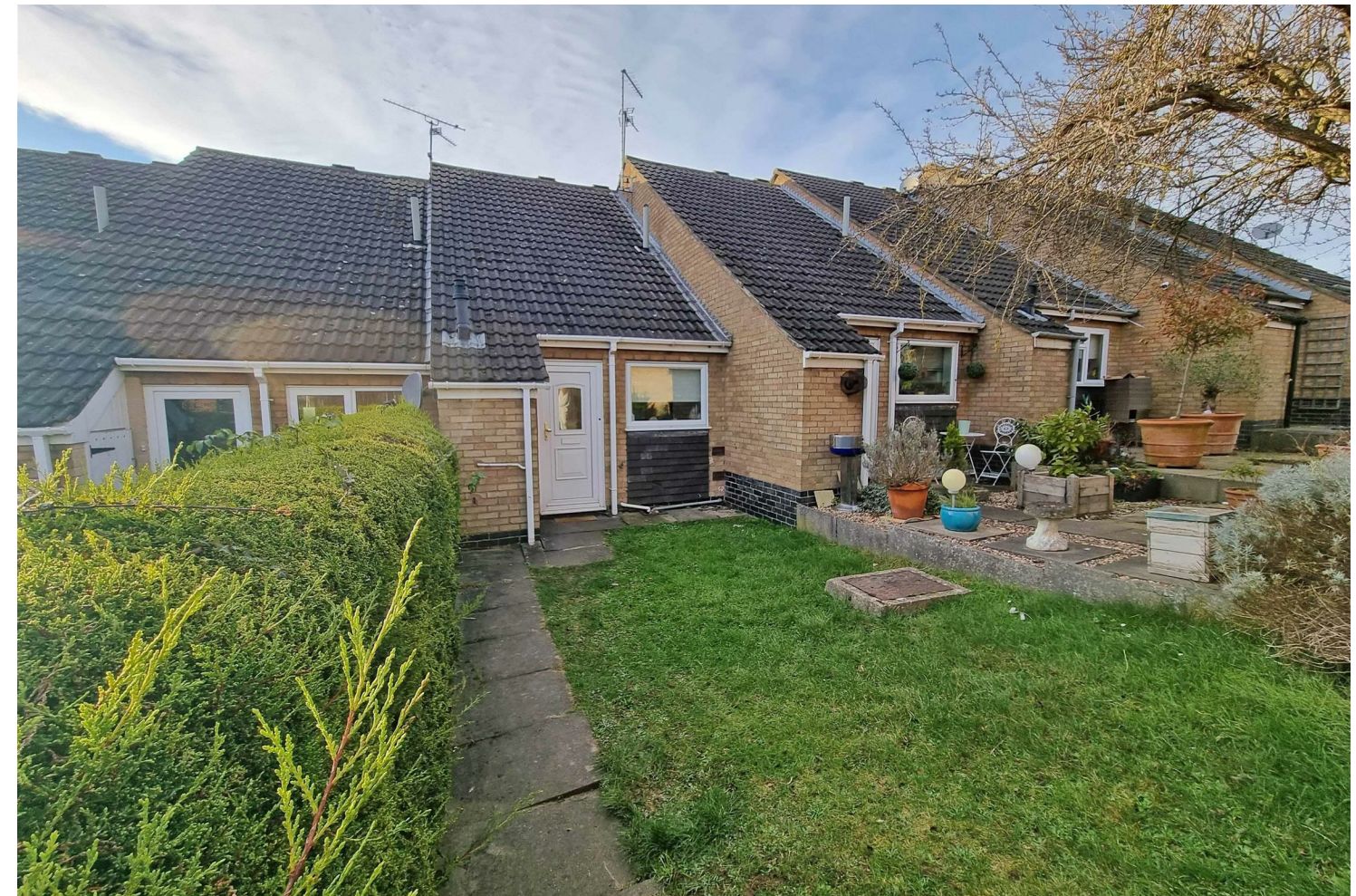
85 Drift Avenue, Stamford, PE9 1YJ