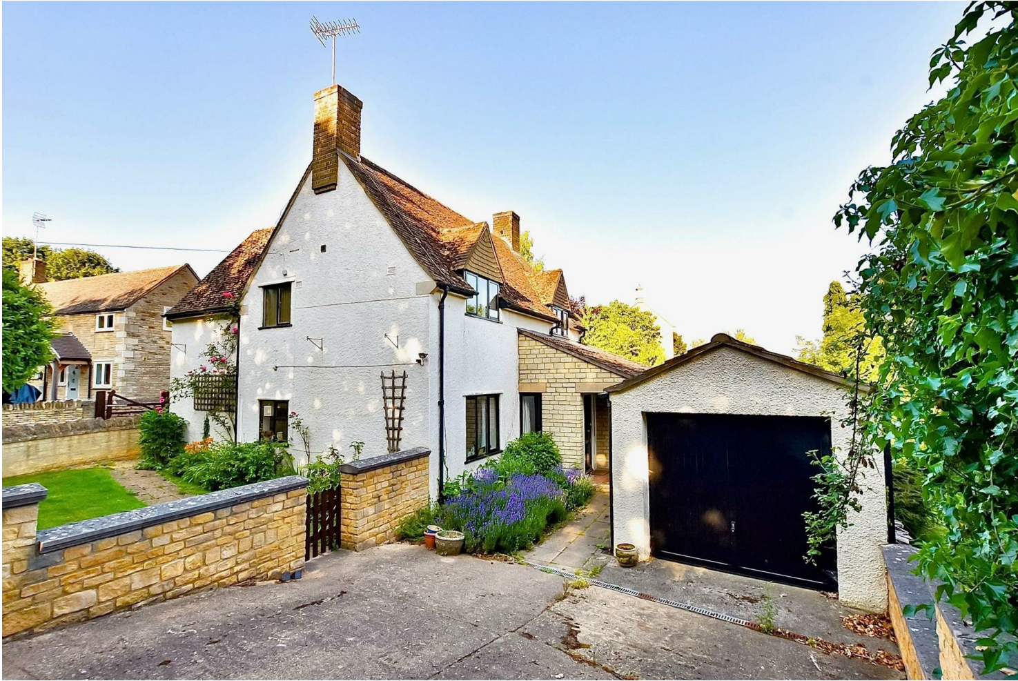
Peets Cottage, Hall Lane, Tixover, Stamford, PE9 3QL

Nestled in the charming village of Tixover, near Stamford, this delightful house presents an excellent opportunity for those seeking a spacious family home. Boasting two inviting reception rooms, this property offers ample space for both relaxation and entertaining.